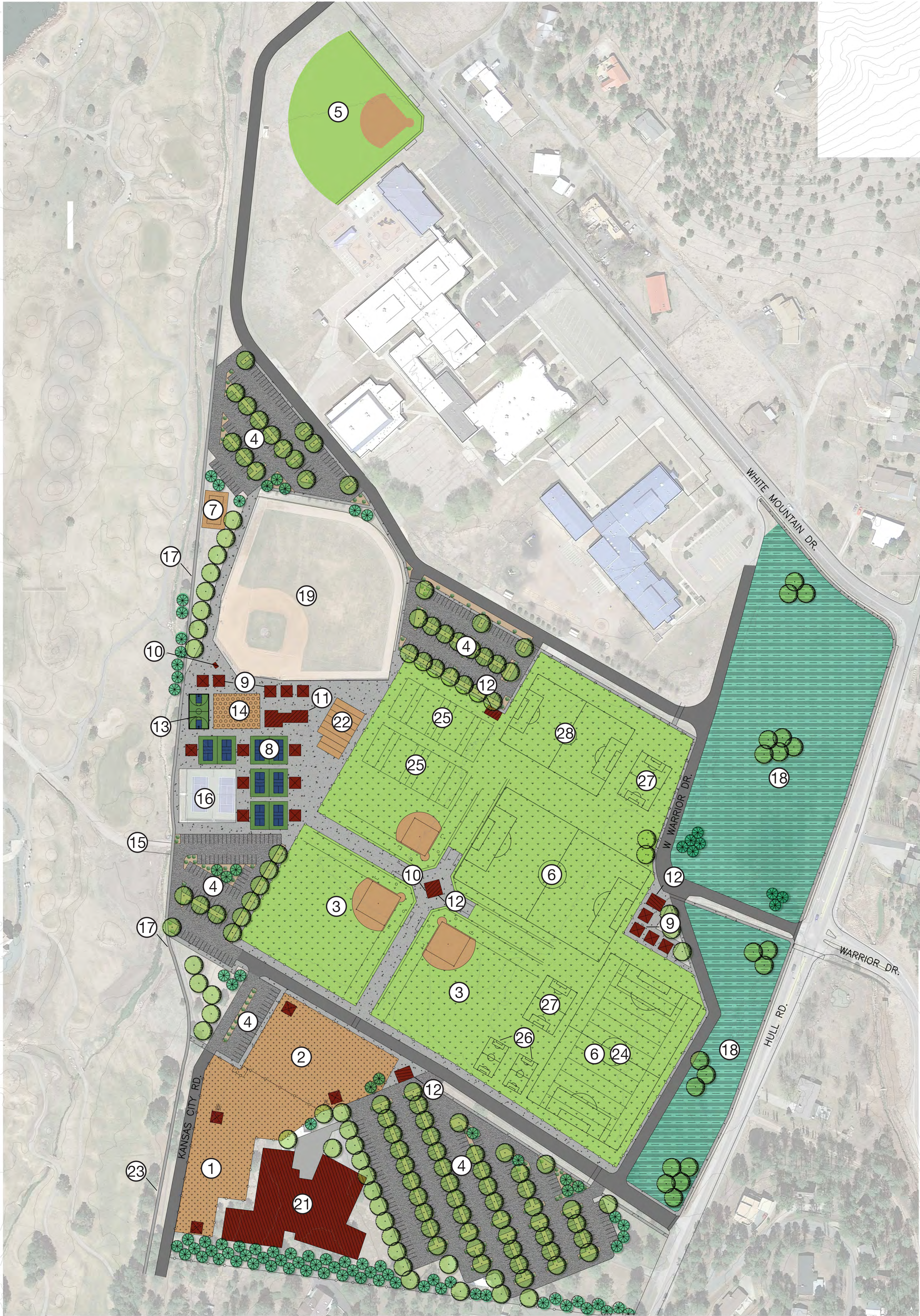
A1 WHITE MOUNTAIN REC AREA – OPTION B FALL (SOCCER AND FOOTBALL) SCALE: 1" = 100'-0"