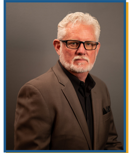
Mayor Lynn Crawford